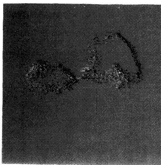
FIG. 4. STM image of C-PC from spirulina platensis . A high magnification 100 \times 100 \text{ nm}^2 scan of the same area as Fig. 3, V_{\text{bias}} = -235 \text{ mV} , I_t = 0.61 \text{ nA} .

Compared with the conventional method of x-ray crystallography, the sample preparation for STM is very simple, and the STM now available can process data almost imme-