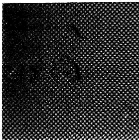
FIG. 3. The STM image of C-PC from spirulina platensis . V_{\text{bias}} = -235 \text{ mV} , I_t = 0.61 \text{ nA} . Scan area: 200 \times 200 \text{ nm}^2 .

hexamer (110 \times 60 \text{ \AA})^2 by head-to-head association of two trimers. The x-ray crystal structure model resembles the STM images of C-PC from spirulina platensis , so the x-ray results support our STM observation, and express that we have decreased the salt effects in STM measurements and really obtained the C-PC individual molecular structure in real-space. According to the models, the STM image of C-PC (Fig. 4) was probably (\alpha\beta)_3 or top view of (\alpha\beta)_6 , every one of the evenly divided three parts of the C-PC image might be a monomer: (\alpha\beta) .